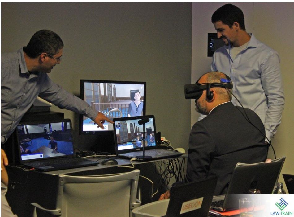
Caption: The 3D virtual environments could be experienced through Augmented Virtual Reality Glasses. This latest version of the 3D environments was presented by the technical partner Compedia.